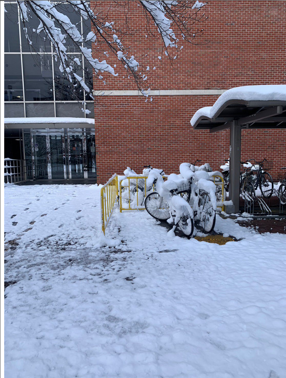
Caption: Walk to the lab on a snow day