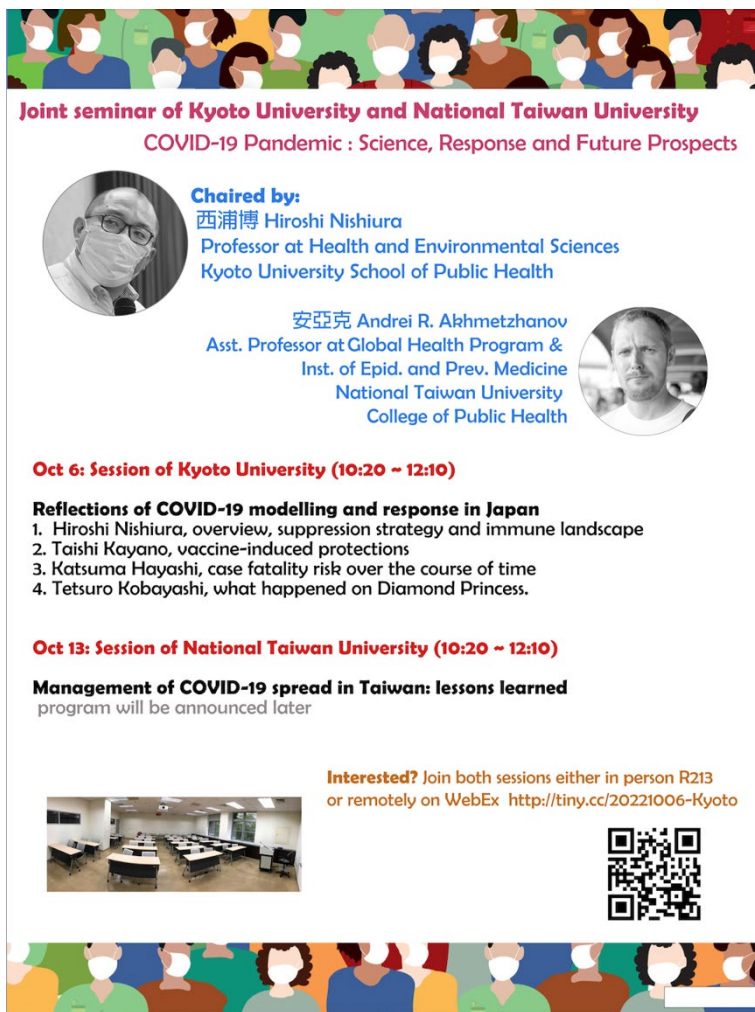
Caption: Poster for the first session of the NTU/KU workshop that was held on Oct 6.