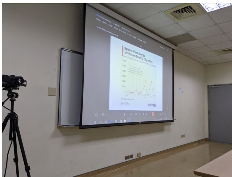
Caption: Installment of the remote talk on the first session of Oct 6.