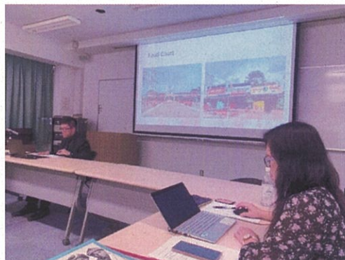
Personal Presentation in KU-NTU Joint Workshop

*E.g. workshop notifications/programs/reports, evidence of academic papers published or otherwise made available, etc.