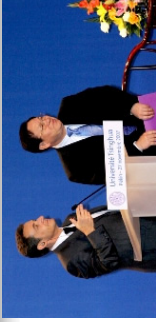
French President Nicolas Sarkozy Belgium Prince Philippe