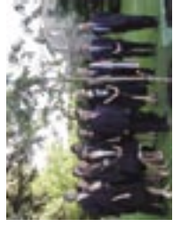
The cherry tree and participants

In commemoration of the 10th anniversary of Keio's Summer School at Downing College, Cambridge, a cherry tree planting ceremony was held.