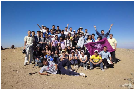
UCLA – CSST Summer Program (U.S.A.)