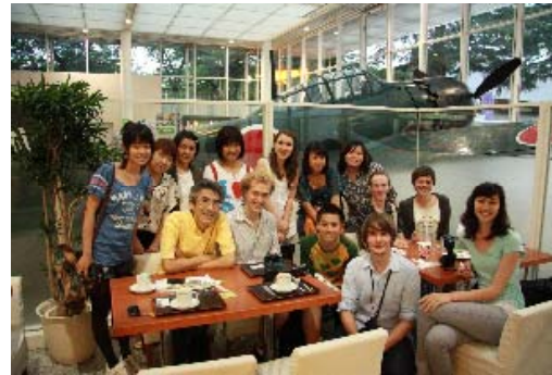
Tokyo University Exchange Program (Japan)