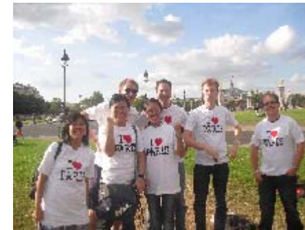
ESSEC Program (France)