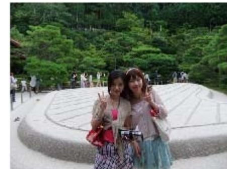
Kyoto University Exchange Program (Japan)