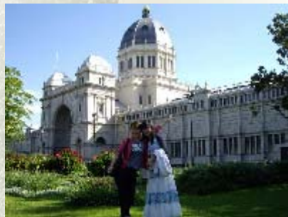
Sydney University Program (Australia)