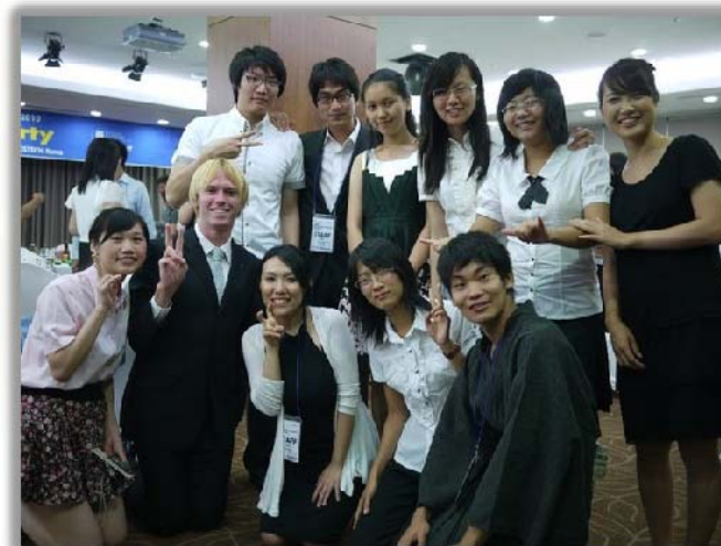
AEARU Program (POSTECH, Korea)