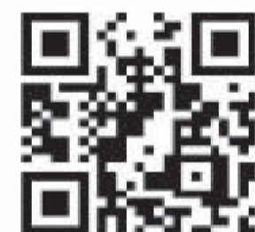
Company Overview movie(JPN)