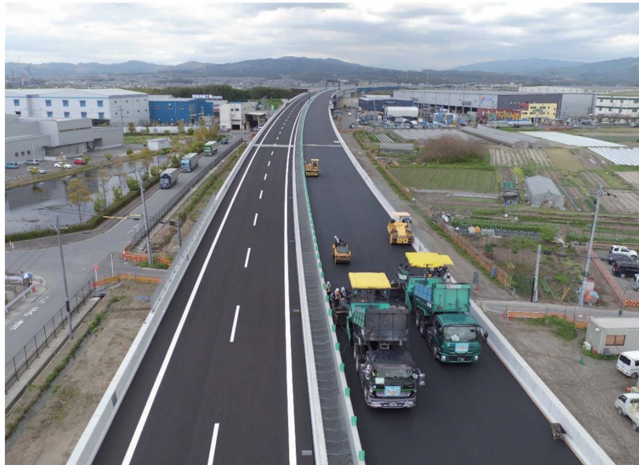
Construction status of high-performance pavement

Site : Shin-MeiShin Expressway JoyoYawatai Contract amount : JPY 3,606 Mln Construction period : 1.9 years Outline : Paving work for new construction : L=5,220m