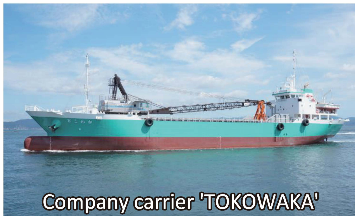
Company carrier 'TOKOWAKA'

This type of carrier is specialized to carry macadams, gravel and sand, equips grab crane for lading and unloading them.