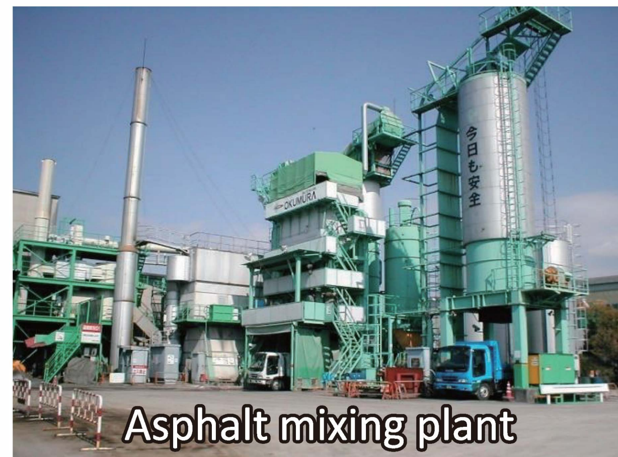
Asphalt mixing plant

This type of carrier is specialized to carry macadams, gravel and sand, equips grab crane for lading and unloading them.