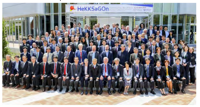
Participants of the 6<sup>th</sup> General Meeting in Osaka, April 2018

In 2018, HeKKSaGOn reached an important milestone by completing its first phase of general meetings. This journey started in July 2010 in Heidelberg, went on to Kyoto in 2012, Göttingen in 2013, Sendai (Tohoku) in 2015, Karlsruhe in 2016 and finally finished in Osaka this year.