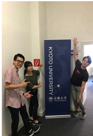
Kyoto University exchange students at KUEC

I am working as a trainee at Kyoto University European Center for one year. During my stay and due to my academic background in Educational Studies, I wanted to find out more about student's motivation to study abroad from an educational perspective. In order to find ways to encourage students, the following questions are essential to me: What is the benefit for students studying abroad? What motivates them? How can we support them?