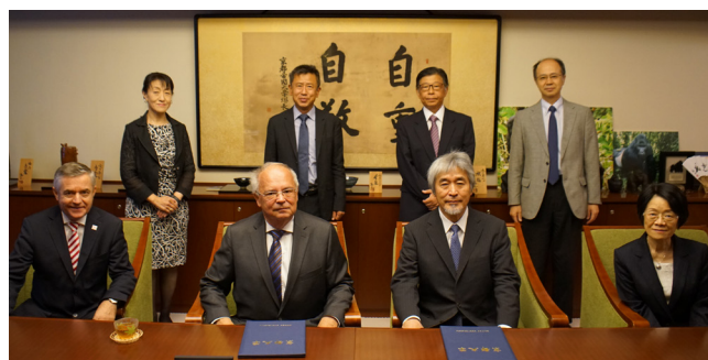
Signing Ceremony between Kyoto University and Universität Wien in presence of the Austrian Ambassador to Japan (left) on October 7, 2019

Université de Bordeaux (France) organized an international symposium in 2014. In the same year, a research exchange agreement between both universities was concluded. In 2015 and 2017, further symposia were held and the multifarious exchange continued.