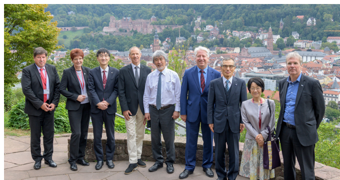
HeKKSaGOn universities' delegations on the Philosophenweg

Presidents and vice-presidents, researchers, students and staff members from six universities, including our center, got together and discussed the achievements and future of the alliance.