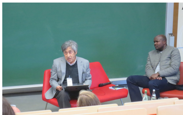
Africa Multiple: Conversations and Building Networks Conference at University of Bayreuth on October 31, 2019

We are pleased to witness this growing collaboration in recent years and we are proud to be able to provide logistical support and ensure the communication for our faculties and young researchers in this field. Overall, with the celebration of the 5th anniversary of the center just a few months ago, this year marked an important milestone for us with much-anticipated projects including research on Africa and collaboration with African researchers. We are looking forward to seeing the developments in the years to come and will keep you updated!