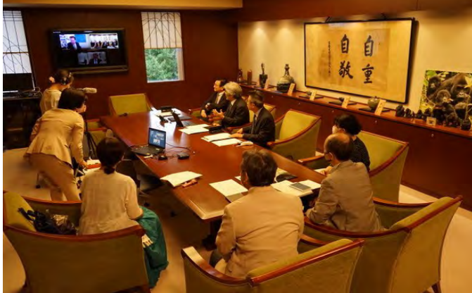
Virtual signature ceremony at the Kyoto University President's Office

The endeavor to conclude strategic partnerships started in 2019 with University of Bordeaux and University of Vienna. In 2020, University of Zurich and Universität Hamburg joined our existing partners. Now, Kyoto University has four strategic partnerships with European universities and one with National Taiwan University.