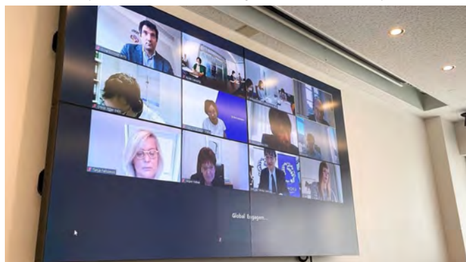
HeKKSaGOn Vice Presidents' Meeting held online on 28 September 2020

This summer, the partners of the six universities German-Japanese alliance HeKKSaGOn sent a call for new projects for its second phase. On 28 September, HeKKSaGOn representatives came together online at the Vice-Presidents' Meeting and chose projects to be funded. The eight selected projects contribute to four priority areas, which were agreed upon at last year's Presi-