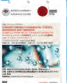
Nichi-Doku Joint Lecture