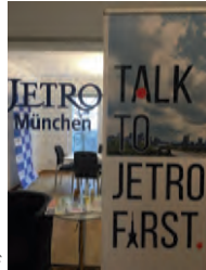
JETRO Office in Munich