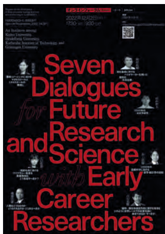
Announcement for "Seven Dialogues for Future Research and Science with Early Career Researchers" 2022

HeKKSaGOn is an alliance of German and Japanese universities – in which we function as a liaison office together with Heidelberg University Office, Kyoto. An attempt to promote dialogue among young researchers (Fellows) using this platform was carried out online last November ("Five Dialogues for Future Research and Science with Early Career Researchers"). As a follow-up programme, we were very pleased that a face-to-face workshop was held at Heidelberg University in November 2022.