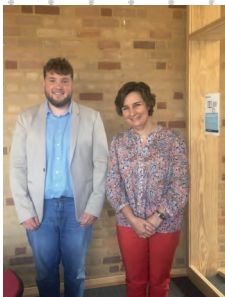
Meeting staff of Université catholique de Louvain