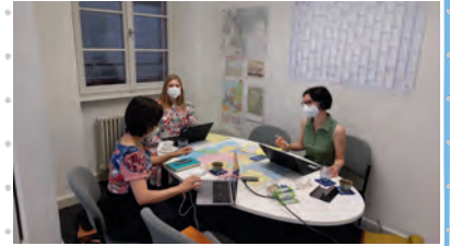
Visit by University of Vienna staff at our office