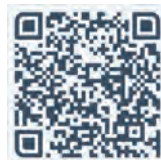
Kyoto University and the Kyoto University European Center offer a variety of events. Stay up to date with information from our news page.

Because of the program's success in Japan, we consider future cooperations in such initiatives with European universities, which offer workshop programs as well as opportunities for international and interdisciplinary ECR exchange.