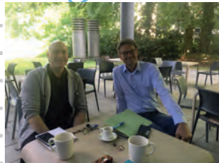
Meeting with the head of Strategic university partnerships in Asia team at Universität Hamburg

△ Annual Celebration at Karlsruhe Institute of Technology ◇ Universität Hamburg