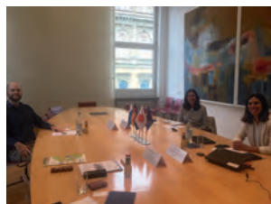
Visit to Technical University of Munich