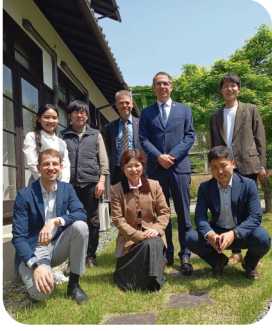
German Academic Exchange Service Representatives at Kyoto University

Kyoto University—as a leading research institution in Japan—has been actively engaging with international partners from academia and politics to expand its global reach and foster collaborations in various fields of study. After the pandemic hiatus, receiving European representatives to Kyoto highlights its commitment to international cooperation and its role in shaping the future of research and education.