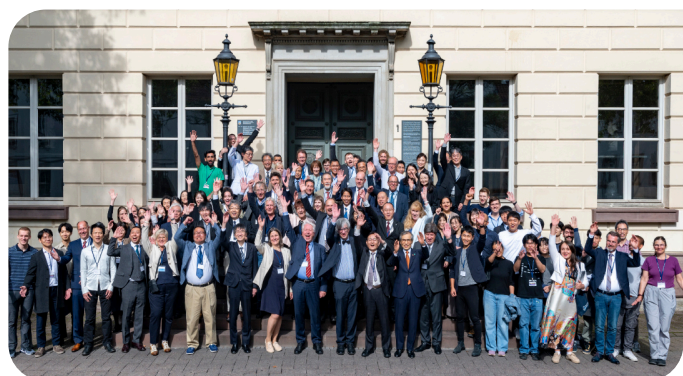
Participants of HeKKSaGOn Presidents' Conference 2023 in Göttingen

The 9th Presidents' Conference of the German-Japanese university alliance HeKKSaGOn, held at the University of Göttingen, marked the first successful in-person gathering since 2019. It brought together over 100 participants, including presidents, vice-presidents, researchers, students, and staff from the six member universities Heidelberg University, Kyoto University, Karlsruhe Institute of Technology, Tohoku University (Sendai), University of Göttingen and Osaka University.