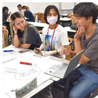
Students at the Kyoto Summer Program

One of KUEC's important tasks is to find and introduce short-term programs to motivate excellent students to participate in. We are very grateful for the fee waiver for summer schools offered by partners such as Heidel-