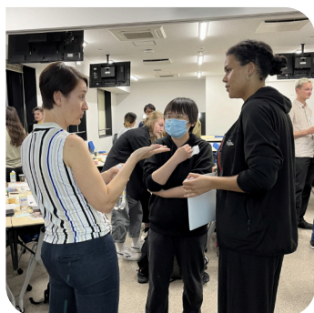
Young researchers networking at the DNA for ECRs event

In the years past, Kyoto University and the German Academic Exchange Service (DAAD) have established a strong partnership to promote academic exchange and collaboration among early-career researchers (ECRs).