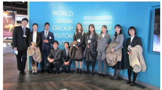
At the World Bank, 2019

KUNAC regularly corresponds with the three official alumni organizations in the North American Region to maintain strong ties.