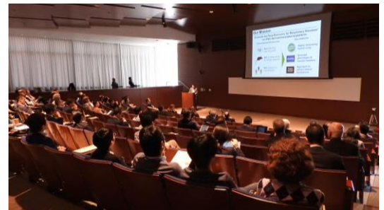
Kyoto University Research Center San Diego