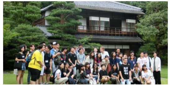
Kyoto Summer Program

KyotoU assists with the program implemented by the University of Texas at Austin.