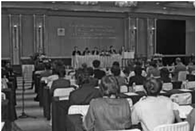
The symposium in progress